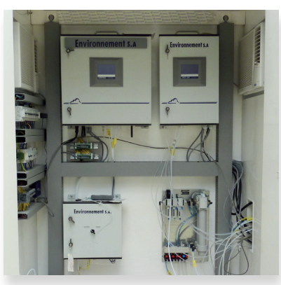
MIR 9000 CLD with the multiplexing system MVS